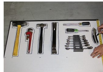
Step 1. Measure and Trace