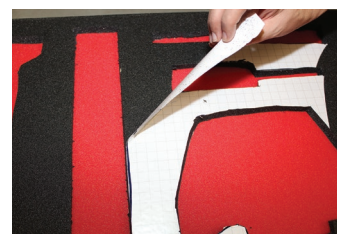
Step 3. Peel-away