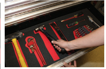
Step 4. Install and Organize