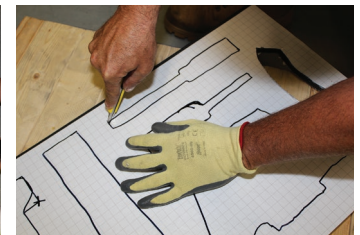
Step 2. Cut with utility blade or X-Acto knife