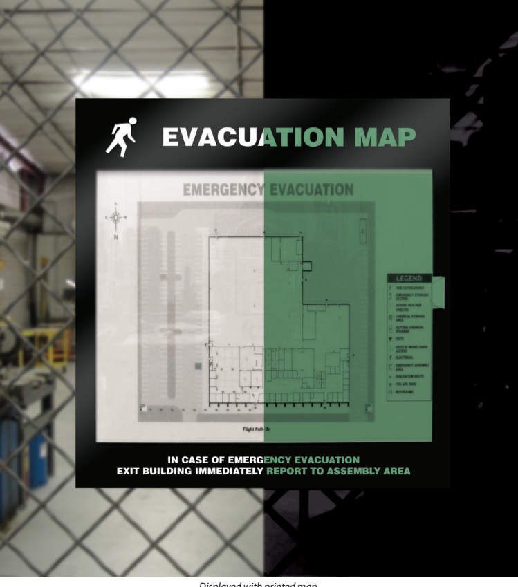
Displayed with printed map