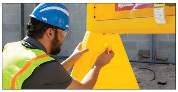
Water fillable leg supports offer added stability

Two person assembly required. Assembly takes approximately 20-30 minutes to complete depending on the number of extra products and accessories to be installed.