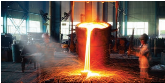
Tough, Rugged Conditions

Keep your customers and employees safe – at a cost that keeps your bottom line in mind.