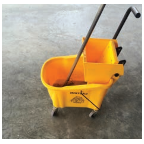
2. Apply only to clean dry floors: thoroughly wash, rinse, and allow to dry, completely.