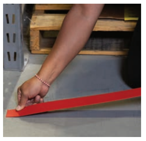
Once satisfied with the placement, continue to peel back the liner and position.