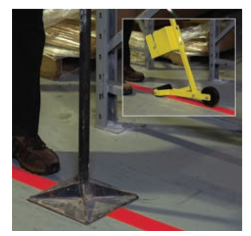
For maximum adhesion, use a tamper device with a minimum of a 150-pound load. Tamp in the same direction that the strips were applied. Several passes should ensure adhesion to the surface.