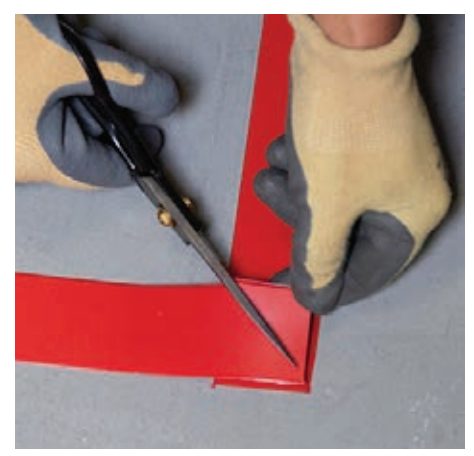
5. Cut adjoining pieces at 45° angles and place together to make a corner.