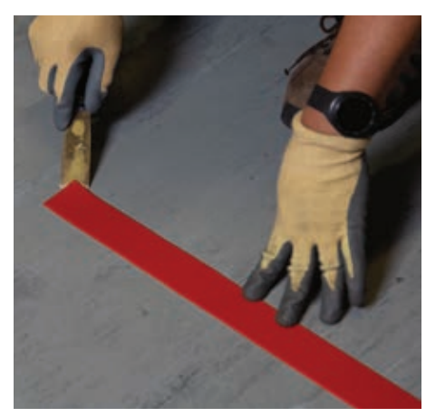
8. To remove Tough-Mark™ strips and shapes, starting at the edge, use a scraper to break the bond between the strip / shape and the floor. Once the edge is lifted peel back the tape to remove.