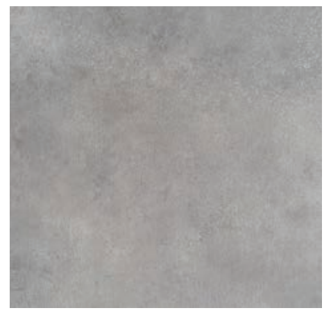
1. Application surface should be uniform and free of cracks or ridges. The ambient temperature should be above 50°F.