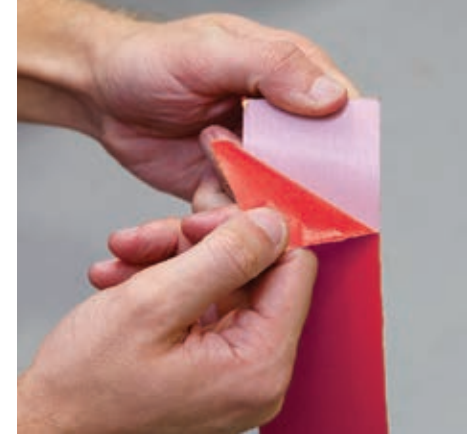
3. Peel back about 2 inches of the liner and start to set in place.